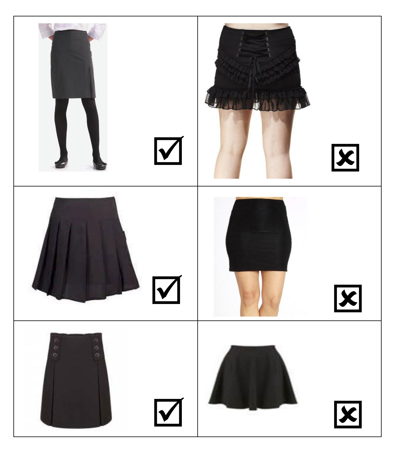
Skirts Skirts must be knee length. They must be loose fitting and plain in design.